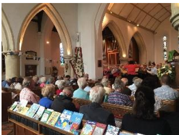
St Peter's Limpsfield