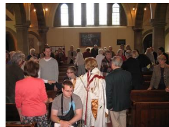
St Andrew's Limpsfield Chart