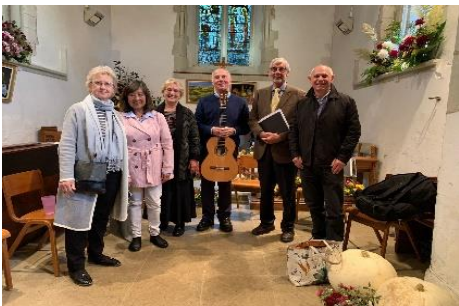
Visiting singers from St Ambrose RC church, Warlingham at a 'Creation' themed service

St Mary's is a member of Churches Together in Oxted and District which comprises eleven churches of varying traditions. Under a Covenant the church has historically been shared with the local Roman Catholic community for whom it is a Mass Centre, however, a shortage of priests has restricted services in recent times. We hope to introduce joint services once or twice a year.