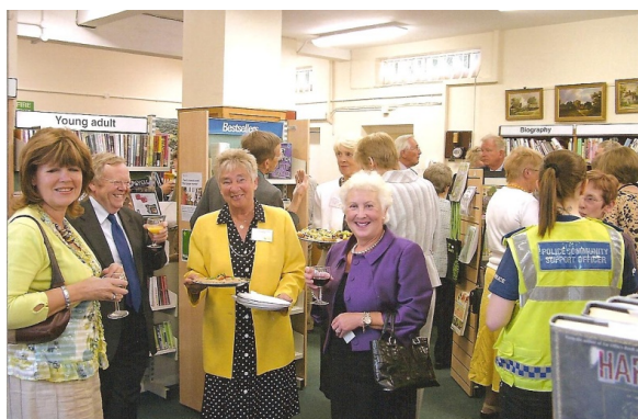
Friends of All Saints'

All Saints' has been focusing on ways to increase its community engagement and commenced a weekly Scrabble group and a Community Choir - both of which have been popular. Messy Church commenced last year, alternating months with St Christopher's Messy Church, this has drawn in many families who come regularly.