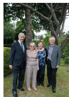
The Churchwardens, PCC Secretary and Lay Chair

'We serve Jesus locally and in the wider world, inviting and encouraging each other on our journey of faith'.