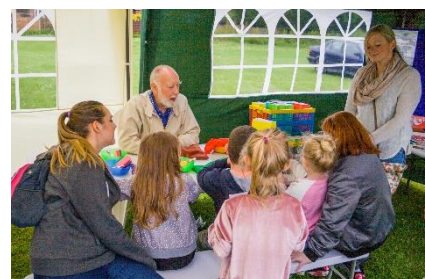
Local children enjoy one of the activities in the Messy Church tent at the Festival