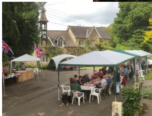
Diamond Jubilee Street Party