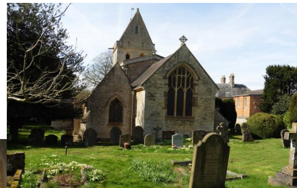
St Mary's, Turweston, in the spring

The parish of Turweston is the most westerly parish in the benefice. It is a popular church and attracts residents from neighbouring Brackley both as worshippers and for baptisms and weddings. It is attractive and peaceful, with farmland around it, bordered to the west by the Great Ouse which is the boundary between Buckinghamshire and Northamptonshire. There are playing fields, which are used by sports clubs in Buckingham and Brackley as well as the village, and a very popular children's playground. Turweston airfield, used by light aircraft and as a park and ride for the Silverstone Grand Prix, is close by to the north, but with no vehicular access from the village itself.