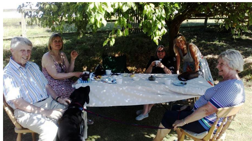
Community cream teas in the Shalstone sunshine

Shalstone has a good community spirit and fund-raising events for the Church are well attended. A Safari Supper around the village and the annual village Harvest Supper are particularly well supported. Occasional Quiz nights and a Summer Cream Tea additionally attract people from around the Benefice and sometimes even further afield. We are particularly keen to be part of the wider community and regular events such as carol singing around the village have been used to support charities such as the Helen and Douglas House Hospice in Oxford.