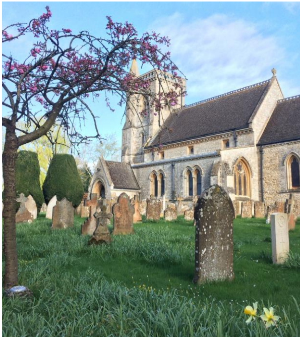
St Edward's, Shalstone, in the Spring