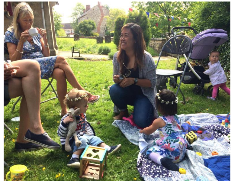
Toddler Church in sunny Tingewick

All our church buildings are beautiful and historic; five are medieval, but with multiple later additions and restorations and one dates from the 18 th century. We all keep up to date with our quinquennial inspections and maintain our buildings as well as we are able.