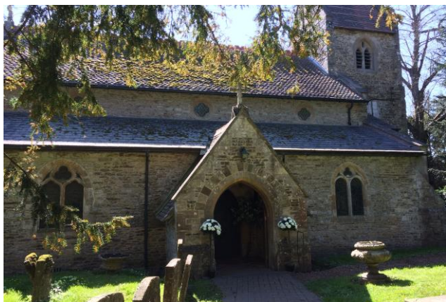
St Augustine's in the summer

After the village pub closed in 2011, a new Village Hall was built and opened through a community effort supported by the Parish Council. This now actively hosts regular courses and village events, and houses the Westbury Community Shop and Café, also established through village-wide community action and run by a volunteer committee. The Village Hall is situated on the sports field, where thriving Cricket and Football Clubs have been very active for a hundred years or more. An excellent children's activity playground has just been revamped and is very popular.