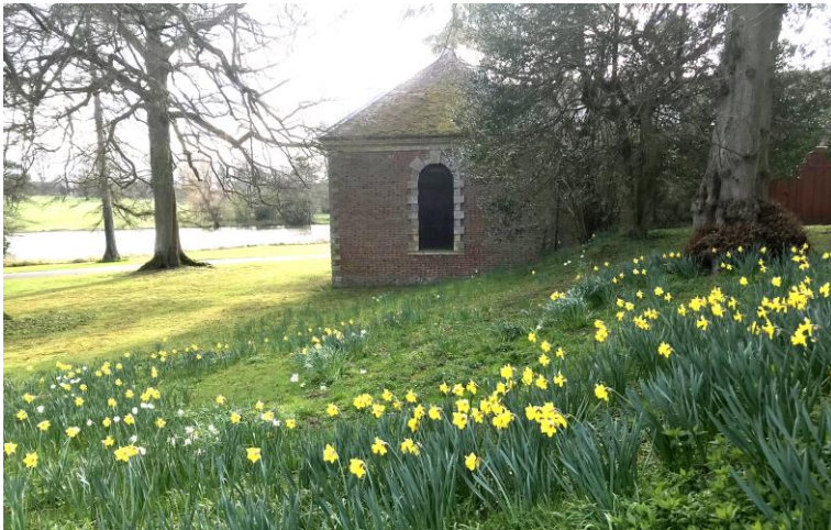
St Margaret's, Biddlesden in the Spring

The Church is central to the village both physically and socially, as there is no shop or pub, but the village does have a good community spirit. The attendance is good relative to the village size and Group Services held in St Margaret's are welcome and joyous events.