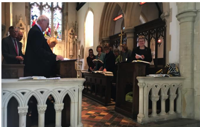
The West Buckingham Benefice Choir singing a Good Friday meditation

Each village and each church has its own characteristic charm. All our churches strive, as part of our worshipping community, to witness to the presence of God in our villages. We are proud to be inclusive and consider being able to offer 'welcome to all' as central to our mission.