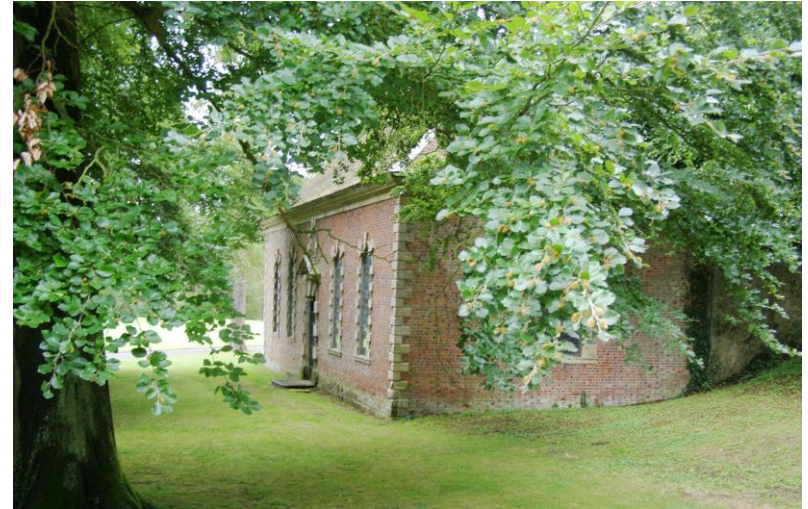
St Margaret's under the beech tree