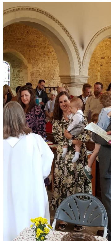
Baptism at St Mary Magdalene's

We have a fund-raising committee who organise a range of events throughout the year including the pig roast at the annual Tingewick Fete, Beer Festival and Classic Car Rally; a Safari Supper; and a Harvest Supper which is well attended by members of the village.