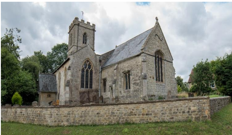
St Mary Magdalene

We are able to seat about 200 people and have recently removed pews from the back of the church to create a useful space which is used regularly for coffee, Toddler and Messy Church, meetings, social events and concerts. A part of our vestry houses a new kitchen and enabled toilet, and there is a small space that could be used as a parish office. There are six members of the PCC, which meets four to six times each year. Our Patrons are New College, Oxford and, from time to time, we go there for tea and Evensong.