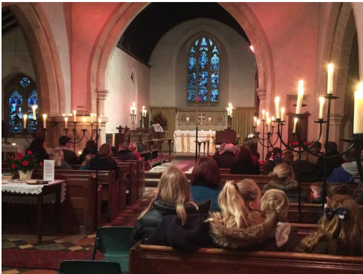
St Augustine's at Christmas

Westbury is the location of the private Beachborough Preparatory School. Beachborough staff are committed to supporting village life, and recently have contributed to a number of village events as well as regularly using the church for school services. They additionally contribute donations from the congregation at their Christmas and the leavers' services, and help with practical maintenance.