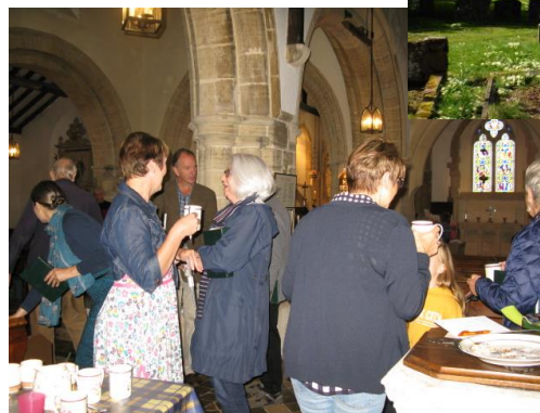
Village Worship at St Mary's