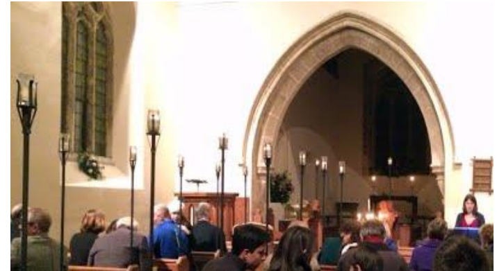
Carols at St Giles