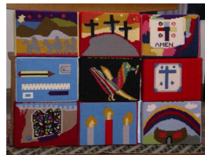
Children's kneeler designs