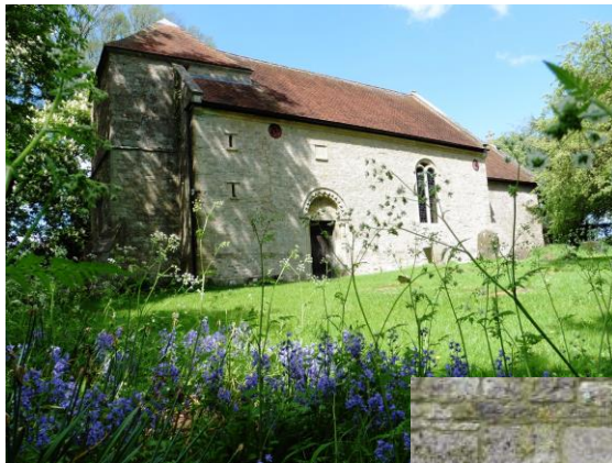
Bluebells blooming at St Giles

There is goodwill towards the church amongst parishioners, and its work is supported by many in addition to those who regularly attend services. We have a good number of volunteer church cleaners, flower arrangers, newsletter deliverers and fund-raisers. Community events, often in aid of The Old School or St Giles' Church, are well attended. This year we have held a Bridge Evening, an event to mark the centenary of the Great Sale of land belonging to the Manor, and we hold an annual Duck Race on the Ouse.