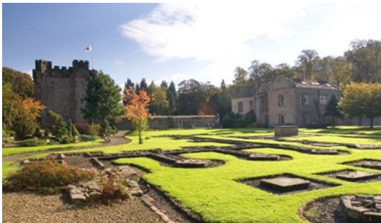
Whalley Abbey Retreat and Conference Centre

We have a great property department, who will do their best to ensure your house works for you and your family and is well maintained. We encourage all clergy to take their full annual leave entitlement, and also to use creatively the overtime we all put in to take an extra day off once each month, to enable you to have a mid-week 'weekend' away.