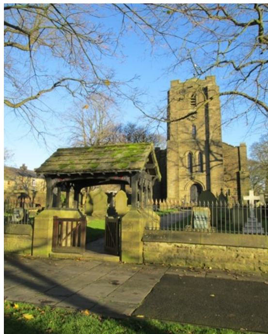
ST JOHN THE EVANGELIST WORSTHORNE BURNLEY