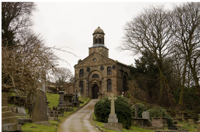
ST JOHN THE DIVINE HOLME IN CLIVIGER BURNLEY