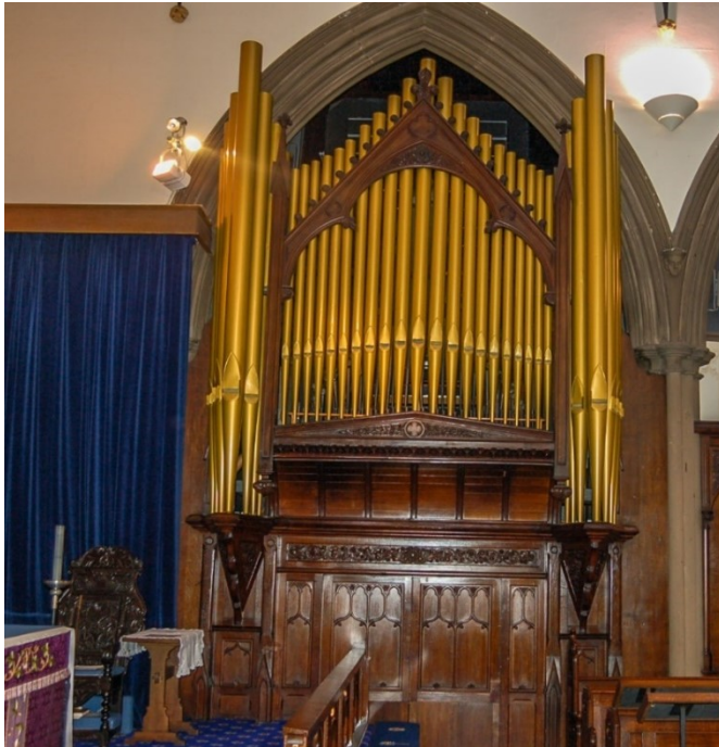
Our magnificent Organ

St George's has a large, active congregation, with a high level of involvement in worship. We have dedicated teams of sidespersons, servers, lay assistants, readers and intercessors. These are supported by wider contributions from, for example, the Verger, and St George's Flower Guild which links to the Church of England Flower Arrangers' Association.