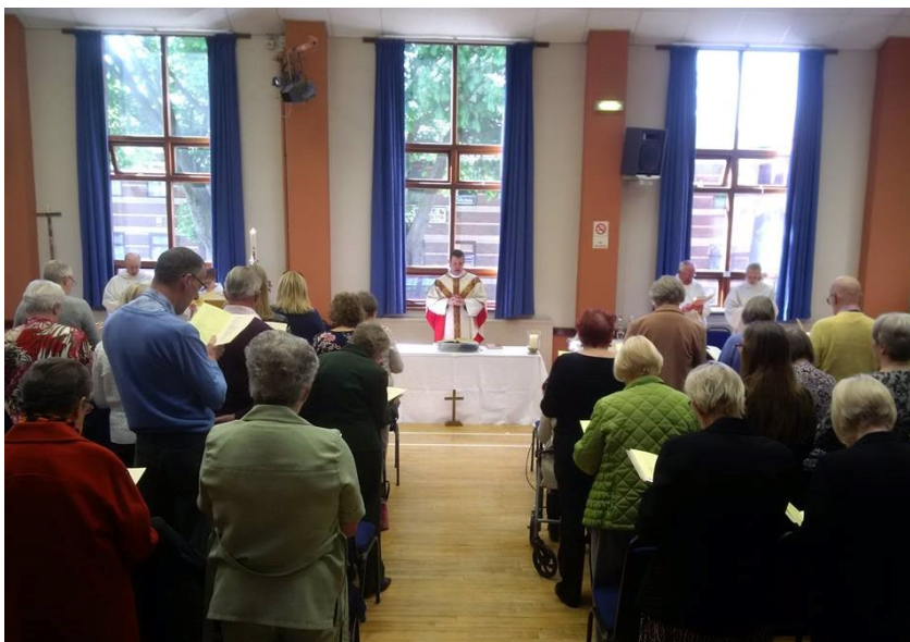
Sunday Eucharist in the Church Hall

Regular maintenance is undertaken within the Church and Church Grounds. We are fortunate to have a small Volunteer Maintenance Team to help with these activities. Our Quinquennial is due to be undertaken this year.