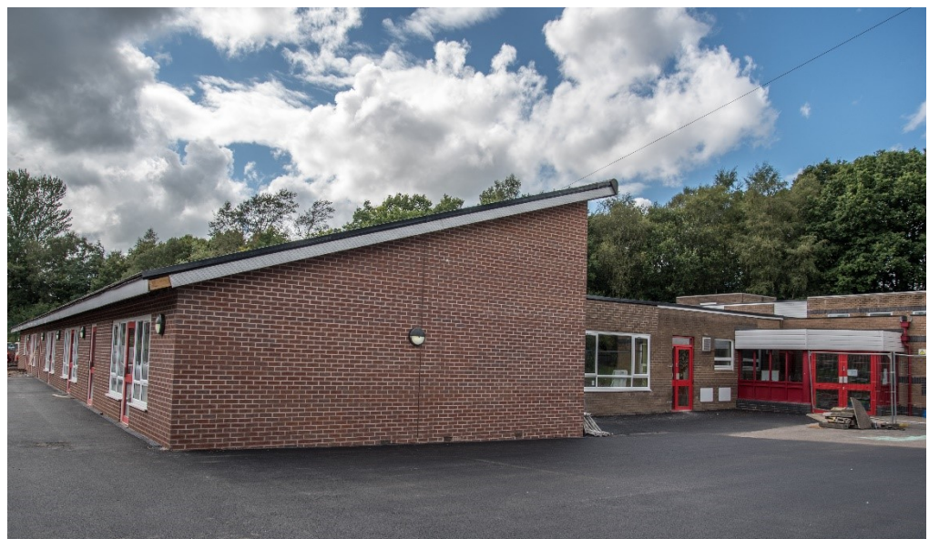
Our newly enlarged Primary School