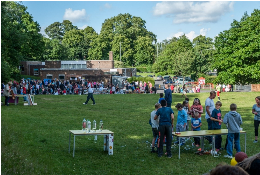
School Summer Fair

We are looking for a Vicar to build on this strong baseline and play a full and active role in the future development of the School and its pupils.