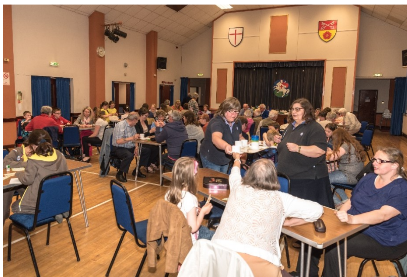
Fund raising event

We have a fairly solid Stewardship base accounting for about 40% of our annual income. No active Stewardship campaigns have been undertaken in the last few years while we have been focused on raising money for our Restoration Fund. It is planned that a Stewardship campaign will be held in 2018 when our current phase of restoration work is completed.