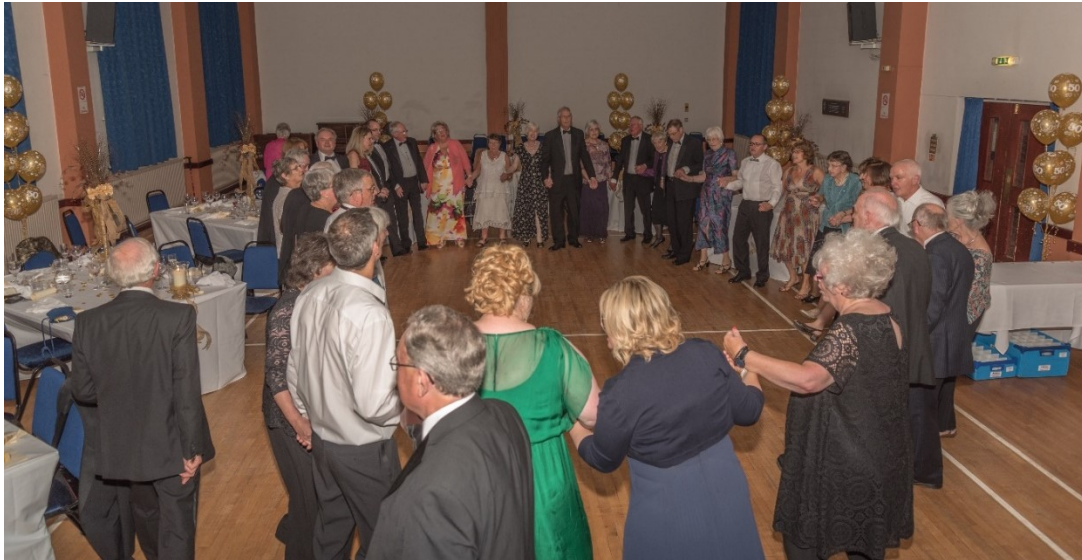
Social Event in the Hall

The Church Hall is adjacent to the Church and was built in 1983; it is a large building with a main hall including a stage and two separate side meeting rooms and a kitchen.