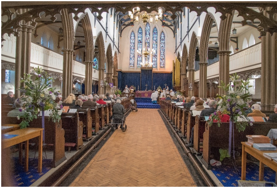
After significant building works, St George's Church reopened on Sunday 3 rd December 2017

The Parish of St George is in the middle of the Borough of Chorley on the south west of the town centre. The Church is in the north-east corner of the Parish and is situated in a conservation area known as 'St George's Conservation Area'.