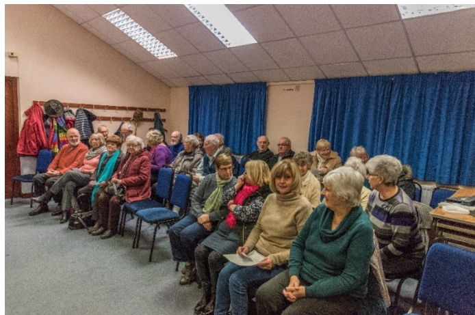
Meeting in Side Room

The building is well maintained and is in a good state of repair. The Church Hall is well used by many organisations, including non-Church groups which contribute to the promotion of community cohesion and extended mission.