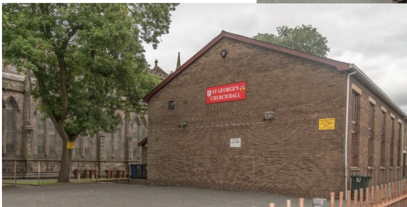
St George's Church Hall