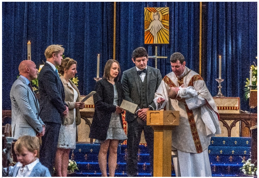
A recent Baptism in Church

An incoming Vicar can look forward to a very supportive and welcoming environment. We are keen to move towards developing our vision, and believe that St George's Church and Parish provide an excellent opportunity to the right person. We are excited about the spiritual growth that this appointment will bring to the future of our Parish.