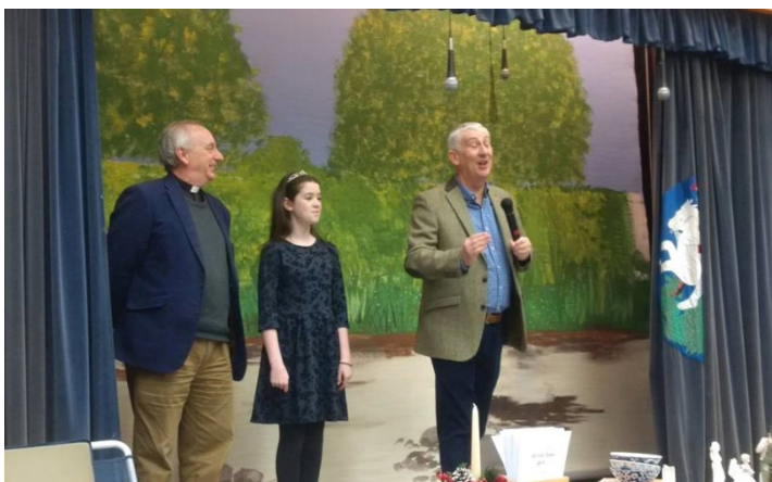
Our MP opens our Christmas Fayre

South Ribble NHS Trust has hospitals at Preston and Chorley (the latter currently only having a 'walk in' emergency facility rather than a full A&E). Whilst Chorley Hospital is not in our immediate Parish, members of our Congregation need to use the facilities there or in Preston from time to time.