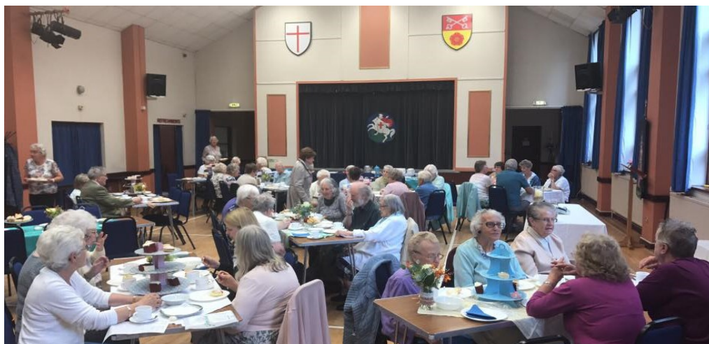
Mothers' Union Social Event

Rainbows, Brownies, Guides and Young Leaders, Beavers, Cubs and Scouts also use the Church Hall and Red Bank Mission Hall for their meetings.