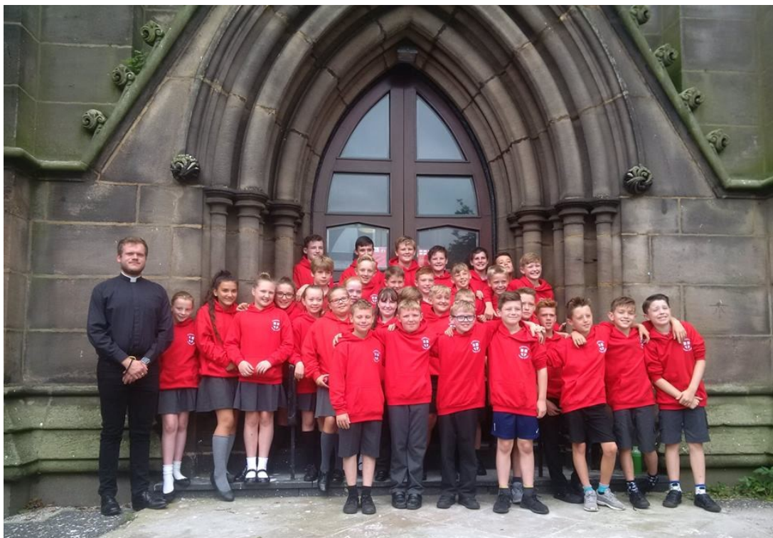
Getting ready for Wednesday Morning Service

The caring, inclusive nature of the School nurtures and supports all pupils. It actively promotes their very good spiritual and personal development and well-being."