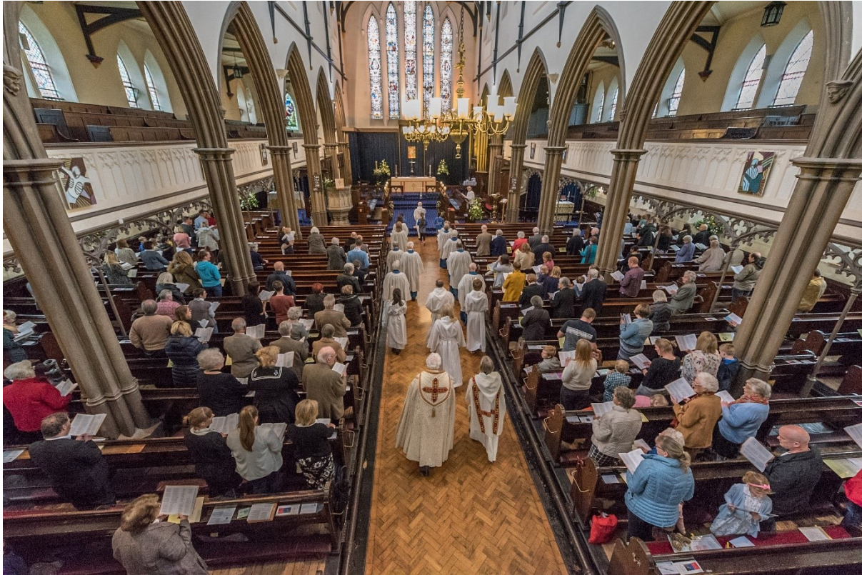
Easter Eve Service

Our organ was installed in the nineteenth century by Jardine & Co with major alterations being made in 1968 by John Cowin Ltd of Liverpool. This enlarged the instrument considerably and it now contains 3189 pipes and 81 drawstops. In 1991 further restoration and cleaning work were undertaken by David Wells Organ Builders of Liverpool which included the modernisation of the Console and the installation of micro-electronic controls.