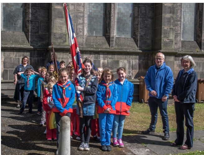
Preparing for Parade Sunday

in line with the Common Worship materials, in that the Service follows a predictable structure.