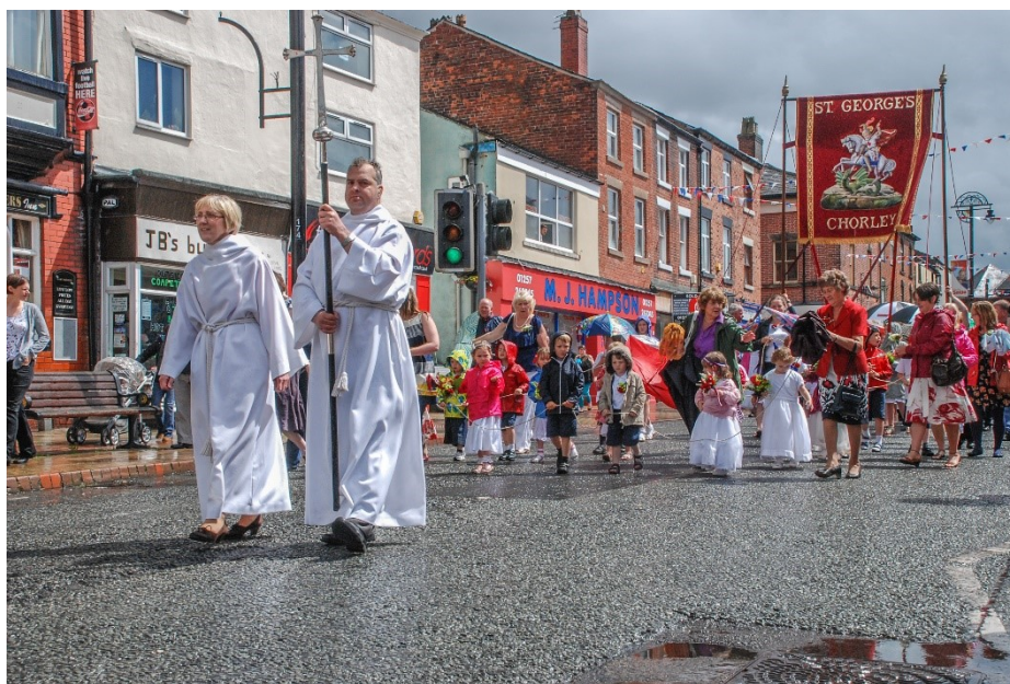
Chorley Walking Day (Walk of Witness)

In 2016, there were 58 Baptisms though this number has fallen in 2017 because of our circumstances. In that year, there were also 7 weddings and 43 funerals of which 13 were conducted at Chorley Crematorium. St George's has one confirmation service a year and in 2017 17