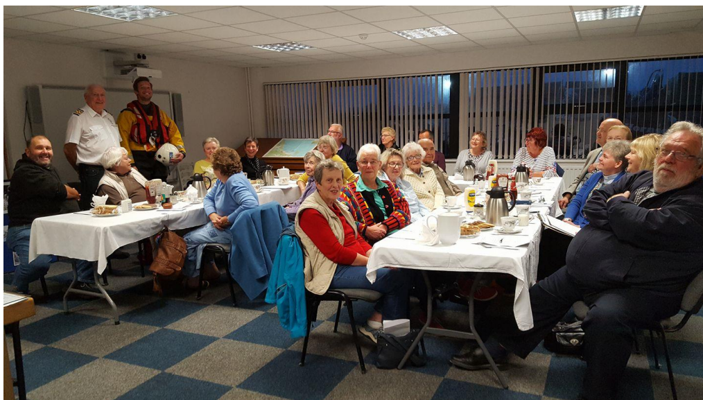
September 2017 – Deanery Synod held at the Hornsea Inshore Rescue Station.

The deanery comprises four benefices and twenty-two churches. Almost all the churches are of historic interest and beauty, and are supported by enthusiastic, if not numerous, churchgoers. Ministry is provided by three full-time incumbent priests based in Hornsea, Beeford, Skirlaugh and a House for Duty Priest in Charge in Aldbrough. At present there is an SSM Curate based in Skirlaugh and two retired priests in the area. In addition there currently are 3 active Readers - in Hornsea, Beeford & Skirlaugh - and a number of Recognised Parish Assistants in Beeford and Aldbrough benefices.