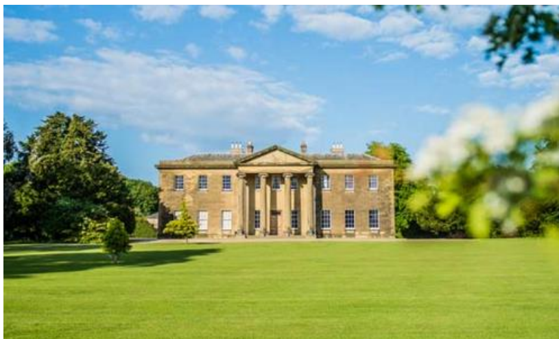
Rise Hall – a popular venue for wedding receptions, attracting over 20 weddings per year to Rise Church