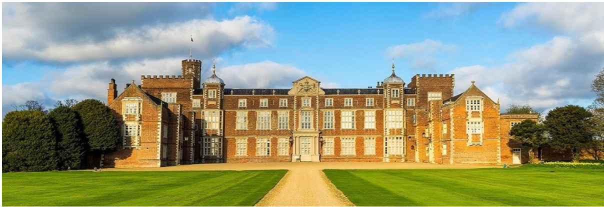
Burton Constable Hall

Key Features include an active schools and young people's ministry, an active benefice pastoral visiting team, a well-received benefice wide newsletter featuring all of village life delivered free to 2000 homes, a benefice music group and a busy occasional offices ministry with around 30 weddings, 30 funerals and 30 baptisms a year and a commitment to individual parish festivals at Easter, Harvest and Christmas showing a passion for incarnational ministry within our communities and of proclaiming God's love for all.