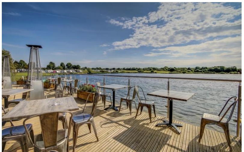
Dacre Park at Brandesburton with Pizzeria