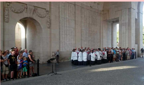
The Choir visiting the Menin Gate.

The church boasts a Mander organ built in 1977 and designed specifically for this building. It is maintained regularly and tuned to Vallotti temperament.