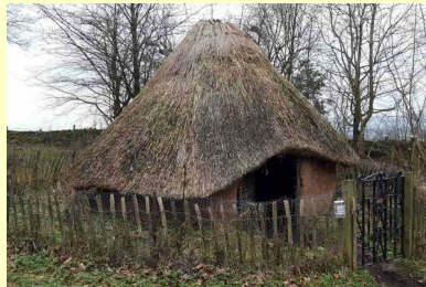
Replica roundhouse built next to the churchyard with the help of local school children.

Every four years Mellor Open Gardens is held where locals open their properties to the public for the benefit of Cancer Research UK and our Parish Centre.