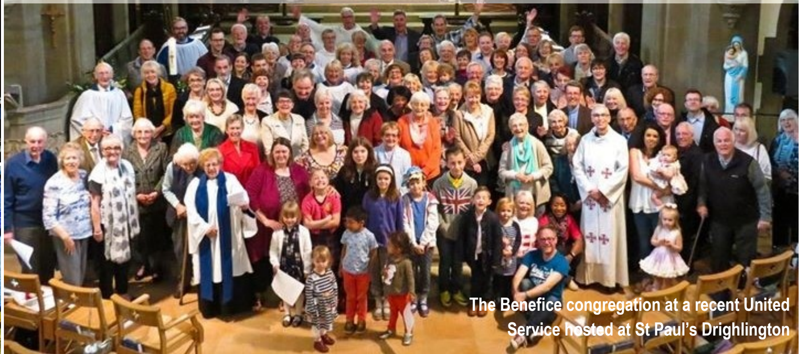
The Benefice congregation at a recent United Service hosted at St Paul's Drighlington