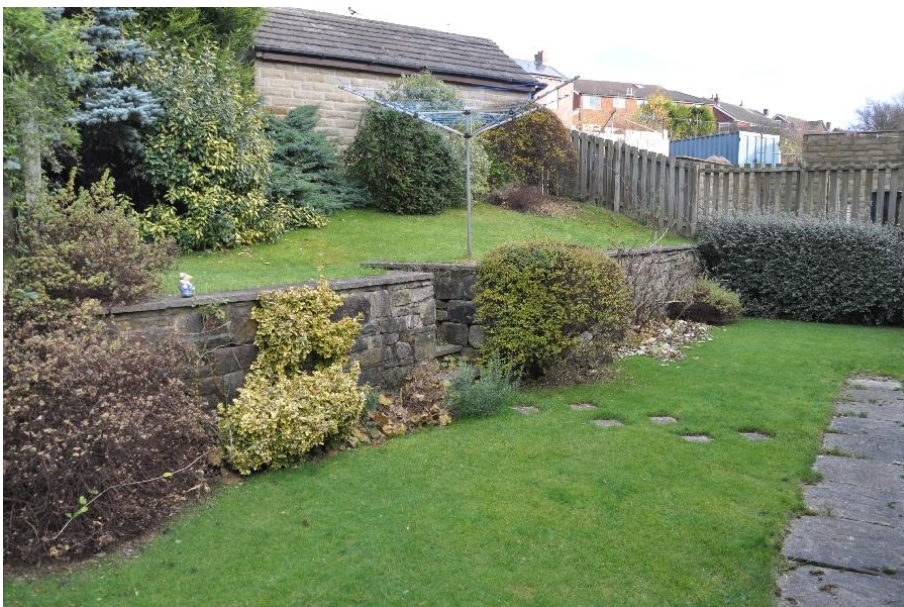
The rear garden