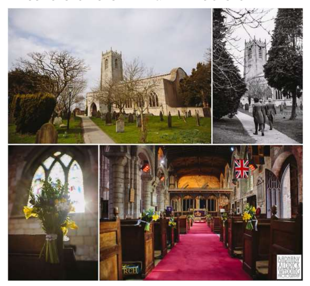
Search Blyth, Scrooby and Ranskill Churches on Facebook

The Church was originally Blyth Priory, dating from 1088, with many historical features such as the medieval Doom painting. It has a bell tower, an organ, a new kitchen, a new WC, new heating and is in good repair. Blyth features in many books on church trails and architecture. The original nave, now the North aisle, is an open space used for hospitality. Tours and meals are offered for visiting groups and story-telling, history tours, concerts and time-travelling events are often held.