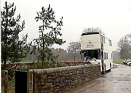
The film company's bus

After all that rain, the cosy tearshop at Gargrave seemed a sensible option. Here it is in festive guise.