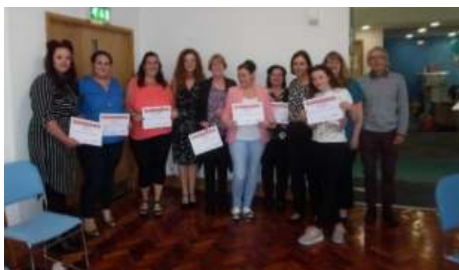
Some of our volunteers who help out at Meet & Eat

The church has just celebrated its 2 nd anniversary by holding a free BBQ, with stalls and entertainment, at which over 200 people came along. This event was followed with a thanks giving service and an evening to thank the many volunteers who help out during Sunday morning services and also at community events. These events have brought the community together for both the young families with our 'Meet & Eat' events (averaging 40 families who come into the church centre to participate in craft activities, enjoy a meal together, and have a variety of games, during the school holiday period) and for people of all ages at fun/fund raising events, such as a 'Line Dancing Evening'.