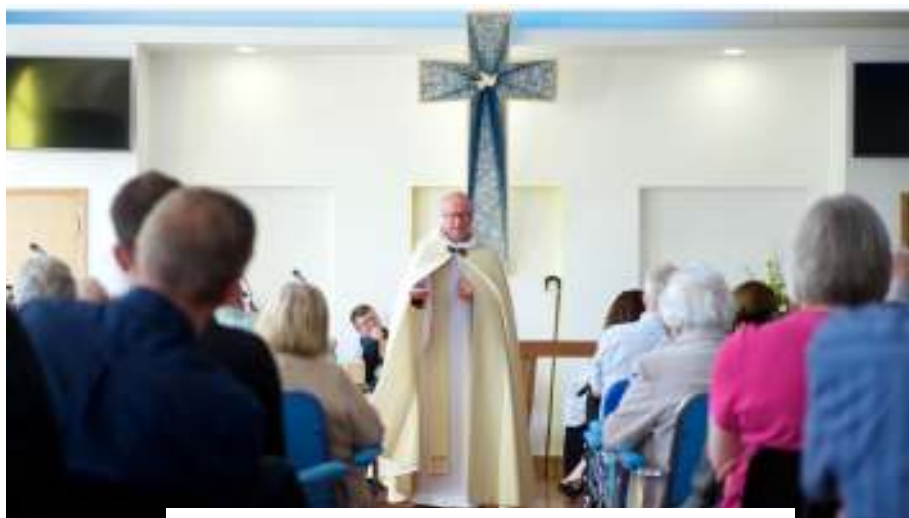
The Bishop at our Dedication service

As work on the building at Bailey Drive began, it was decided to explore the possibility of working with the Orrell Trust to obtain funding for projects that could be run at the Church. St John and St James is now in a working