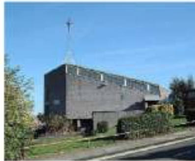
St Paul, Hatton Hill