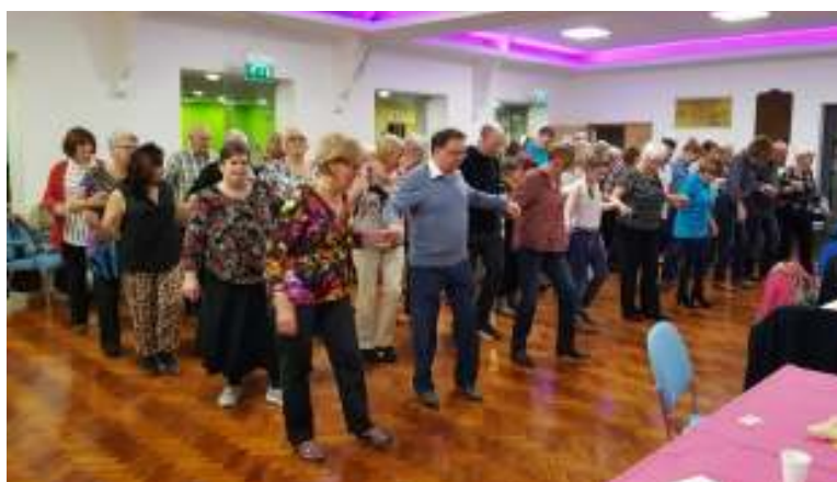
One of our fun nights, this time Line Dancing

Within the parish there is Northfield Community Church but we also have close links with Bootle Elim Church; just outside the parish. Within the parish there is a Children's Centre within Springwell Park Primary School, Nursery, two primary schools, and a high school. There is also one nursing home and two sheltered housing establishments.