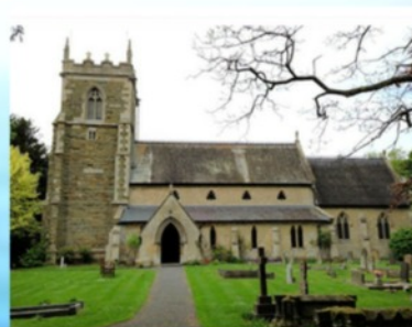
St. John the Baptist Gt. & Lt Carlton