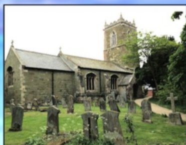
St. Leonard's South Cockerington