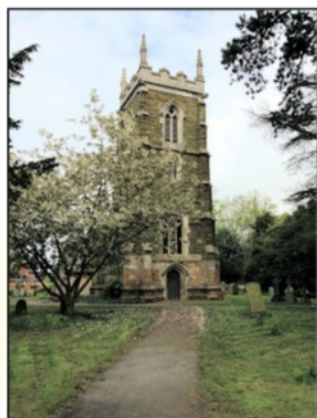
St. Mary's Manby