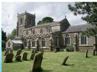
St. Edith's Grimoldby