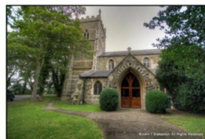
St. Helen's Theddlethorpe