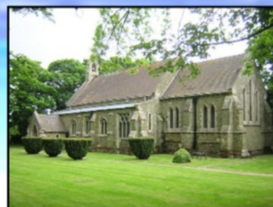
St. Peter's Saltfleetby