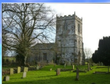
St. Adelwold's Alvingham