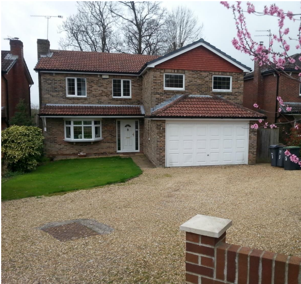
The Vicarage, 5 Deanswood Drive, Waterlooville, PO7 7RR

Located in a quiet cul-de-sac 0.9 miles from the church, the Vicarage was built in 1986. It is a spacious two storey detached house, with double garage and ample off road parking. There is an enclosed rear garden backing on to Jubilee Park and surrounded by mature woodland. The garden is at a higher level than the park with no direct access. The garden has a substantial patio with gazebo which has been used for parish social activities. The house is fully double glazed with gas central heating. Accommodation includes two reception rooms, kitchen and cloakroom on the ground floor with five bedrooms and two bathrooms on the second floor. The Vicarage also has Wi-Fi access.